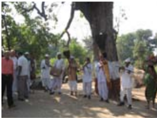
Conference Chotro II. Welcome to Tejgadh